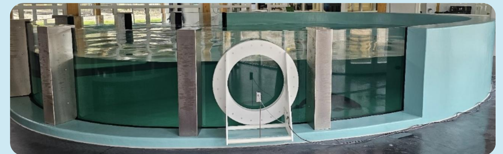
Fig. 2 Experimental set-up showing the custom-built EMF generator (WaterProof B.V.) next to the glass wall.